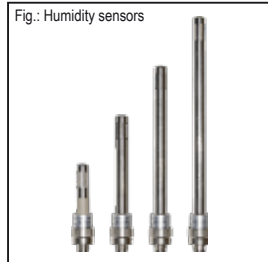
Fig.: Humidity sensors