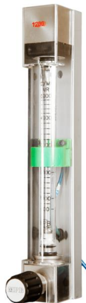
MPB Series 1200SVA fitted with IS ring sensor

Customised flow ranges are available. Please consult MPB Industries to select the required flow range for the process fluid used.