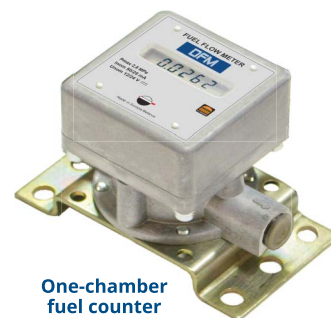
One-chamber fuel counter