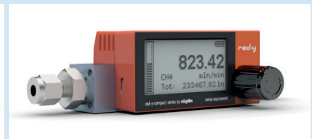
Various Inlet and Outlet Fittings