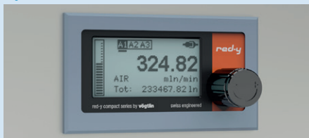
Panel Mounting Kit